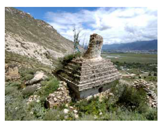
The ruins of a large stūpa at the site.

from this, there is little more that we can say about this hermitage at the present time.