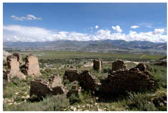
The ruins at the site of Sera Gönpasar Hermitage (Se ra dgon pa gsar ri khrod)