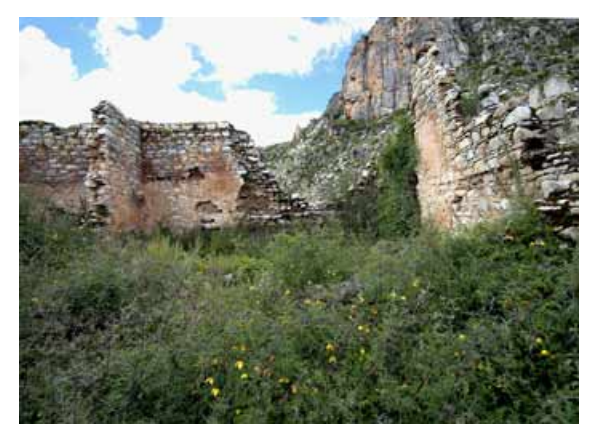
Inside the ruins of the main compound.

Main compound: This was by far the largest group of buildings in the monastery, housing various important temples, a library, and the residential quarters of the Mkhar rdo bla mas. At the front (lowest on the mountain), the compound was three stories tall; at the rear it was two stories in height. As one went in the main door ( gzhung sgo ), located at the front of the compound at the bottom-most level, one first came to a room that is said to have been built on top of the uppermost part of the Ha ha rgod pa'i dur khrod. This was a large (eight-pillar) room that was in almost total darkness. It housed many self-arisen images, but apparently was not for any specific purpose.