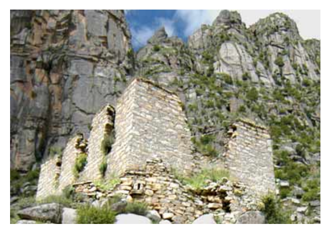
The Temple of the Sixteen Arhats.

The Upper Residence. Just uphill from the main compound is the so-called "Upper Residence" (Gzims khang gong ma).<sup>7</sup> This compound was not, strictly speaking, under the aegis of the hermitage, but rather was administered by Tibetan government. It had two floors. On the first floor it contained a protector deity chapel. The Tibetan government would send monks from the Tantric College (Sngags pa grwa tshang) once a year (in the summer) to conduct rituals in this chapel. The second floor contained the private quarters of the Seventh Dalai Lama Kelzang Gyatso (Da lai bla ma sku phreng bdun pa bskal bzang rgya mtsho), and of Mkhar rdo bzod pa rgya mtsho. It may be that this compound was originally constructed to serve as the residence of the Seventh Dalai Lama when he visited his teacher, Bzod pa rgya mtsho. If this is the case, then this small compound predates the main compound.