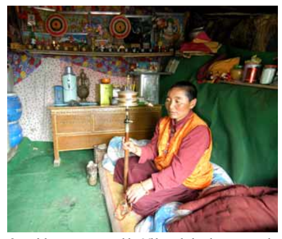
One of the caves occupied by Mkhar rdo bzod pa rgya mtsho when he first arrived at the site. Today it serves as a nun's meditation cell.

Farther up the mountainside still are the caves originally used by Mkhar rdo bzod pa rgya mtsho before he built the first structures at the site. Before 1959, women were not allowed inside these caves. Today, nuns use these as retreat places. The nuns also serve as caretakers.