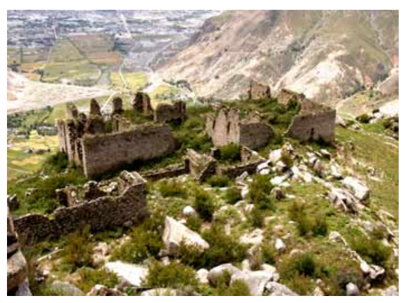
The ruins of Khardo Hermitage.