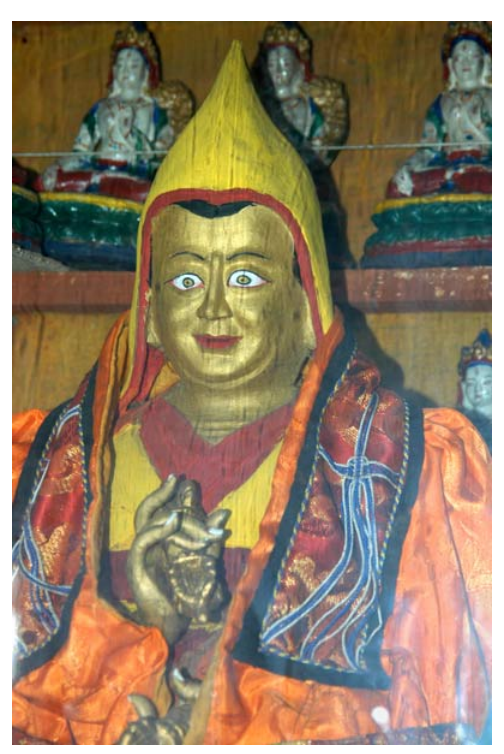
A statue of Mkhar rdo bzod pa rgya mtsho preserved at Rakhadrak Hermitage (Ra kha brag ri khrod).