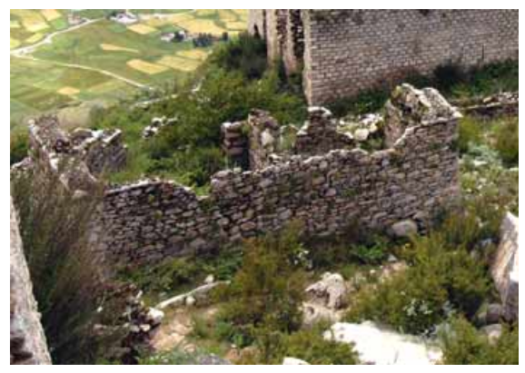
The ruins of the Upper Residence.

bandits and other criminals had, throughout the years, been added to the collection of human limbs suspended form the ceiling. Next to this chapel, there was a room called the Treasure-House of Vaiśravana (Rnam sras bang mdzod). It contained eight "wealth-box" ( yang gam ) where the ritual wealth-vases for the monastery were kept. This room was opened only once a year on New Year's day; otherwise it was kept locked.