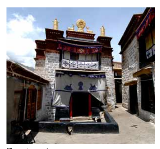
The main temple.

With the exception of a portion of the Temple of the Three Protectors – whose original walls remained intact up to the height of the top of the windows – the main compound has been rebuilt from the ground up. Informants report that there has been an attempt to maintain the original layout of the compound as a whole.