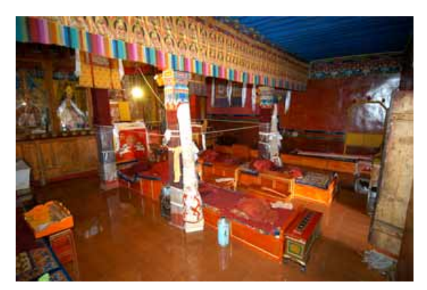
The interior of the main temple

Proceeding west out the principal door of the main temple compound, one comes immediately to the entrance of the compound that contains the Dharma enclosure (chos rwa) and the new library. That library, which in 2004 was just being completed, is being built so as to house a collection of the Bstan 'gyur. The vast open space that is the Dharma enclosure once housed the famous "Dharma Enclosure Assembly Hall" which we know was much bigger than the other temple at Phur lcog. This temple, however, was destroyed and has not been rebuilt. Today only a few of the murals along the base of one of the walls in the Dharma enclosure remind us of the existence of such a building.