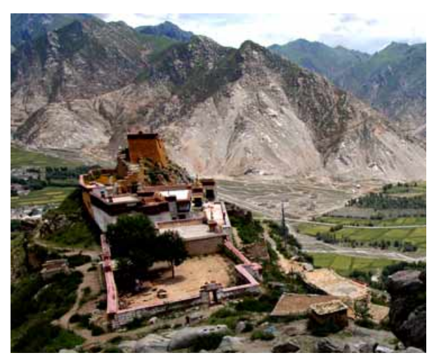
Purchok Hermitage (Phur lcog ri khrod) as viewed from the mountain behind it.