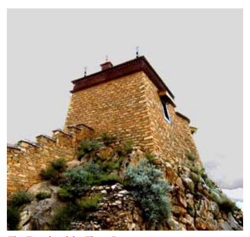
The Temple of the Three Protectors.

As for the actual site on which the hermitage was built, different meditators have had different visions of it. In what we have elsewhere called the "metaphysical rhetoric of sacred space," sometimes Phur loog is claimed to be identical to the six-syllable mantra\ (sngags)\ (om\ mani\ padme\ h\bar{u}m) , sometimes it is seen as the Palace of Cakrasamvara (Bde mchog gi pho brang), and at other times as the paradise of the Three Protectors.