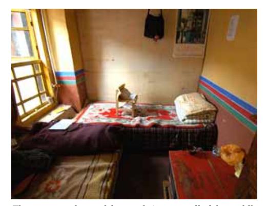
The interior of one of the monks' rooms off of the middle courtyard in the main temple compound.

As one follows the steps down from the Temple of the Three Protectors, one arrives at the next major tier of the compound, which contains a courtyard with several doorways: