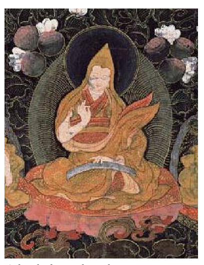
the collection of the Rubin Museum of Art (Image no. 105 on the www.himalayanart.org website) identified as Sgrub khang pa.

During Sgrub khang dge legs rgya mtsho's (1641-1713)^6 peregrinations throughout Tibet in the late seventeenth and early eighteenth centuries, he decided to visit Zangs ri, the place where, several centuries earlier, the great female saint Ma cig lab sgron (twelfth century) had founded her famous center of Zangs ri mkhar dmar. On the night before he was to visit Zangs ri, Sgrub khang pa had a dream in which a man wearing a black hat communicated to him that in a place called Dog bde there was a white stūpa . The man told him that a house was to be built there, and then a great light filled the area around the stūpa . The next day, when he visited the temple at Zangs ri mkhar dmar, he saw that the A detail of an eighteenth century painting in man in his dreams was depicted in a statue on the main altar, and he learned that it was none other than Ma cig lab sgron's son,