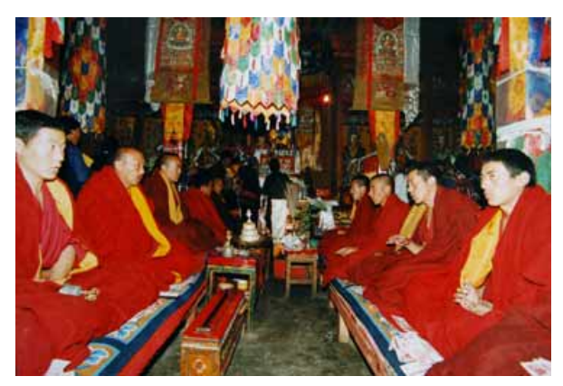
Monks perform rituals during the Sixth-Month Fourth-Day pilgrimage day. Phur lcog is the last hermitage that laypeople visit when they make the Sera Mountain Circumambulation Circuit (se ra'i ri 'khor) on this day.

build there a "library" to house a collection of scriptures ( Bstan 'gyur ). This library was still under construction in 2004.